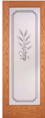
HARVEST™ E631 SIGNAMARK RED OAK