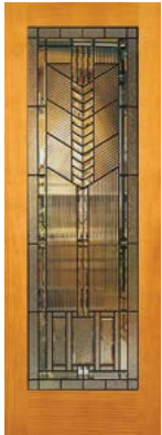
PHOENIX™ P710 SIGNAMARK PINE

FOR PAINT FINISH – PRIMED MDF DOORS (ALTHOUGH ENTIRE LINE OF DOOR PRODUCTS CAN BE PAINTED, PRIMED MDF IS RECOMMENDED FOR BEST PAINTING RESULTS): PREPARE DOOR AS LISTED ABOVE. PRIMED MDF DOORS ARE PRE-PRIMED, SO ALL YOU NEED TO APPLY IS 1-2 COATS OF EITHER LATEX OR OIL BASED PAINT. FOR SIGNAMARK WOOD SPECIES DOORS IT IS RECOMMENDED TO APPLY A PRIME COAT FIRST BEFORE PAINTING. THEN APPLY TWO COATS OF EITHER LATEX OR OIL BASED PAINT. FINISH ALL SIX SIDES OF THE DOOR SLAB WITH PRIMER AND PAINT. NOTE: ALWAYS FOLLOW PAINT MANUFACTURER'S INSTRUCTIONS FOR BEST RESULTS.