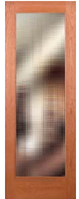
CROSS REED G455 SIGNAMARK CHERRY