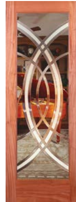
COSMO™ GROOVED G170 SIGNAMARK MAHOGANY