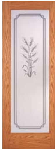
HARVEST™ E631 STAINTRU™ RED OAK