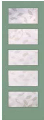
FIVE PANEL FOSSILE™ L005 PRIMEADVANTAGE™