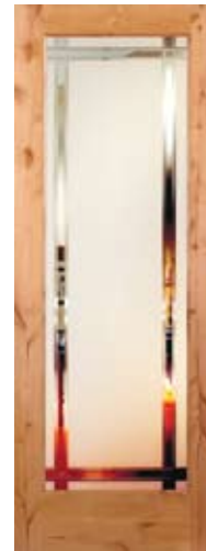
9-LITE MICRO REVERSE G155 STAINTRU™ KNOTTY ALDER