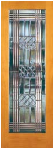
TIBURON™ Z760 ZINC STAINTRU™ PINE

Note: Always follow paint manufacturer's instructions for best results.